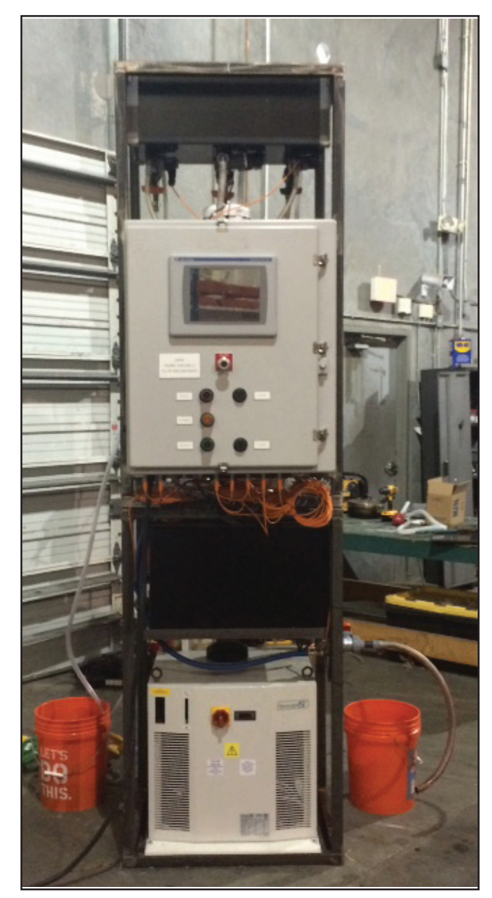
Pfannenberg CC 6301 chiller in a rack-mount Ferrator prototype.

The breakthrough device is called a Ferrator, initially available as a trailer or skid mounted system with various capacities targeted for water treatment applications in rural areas. The Ferrator is suitable for a variety of applications including municipal wastewater, industrial wastewater, drinking water, ship ballast water, and environmental water restoration. Ferrate is highly effective for oxidation, disinfection, coagulation, de-watering, and deodorizing. Ferrate treatment removes phosphates and heavy metals; kills spores, bacteria, viruses and protozoa; removes colors and odors; and its by products are nontoxic.